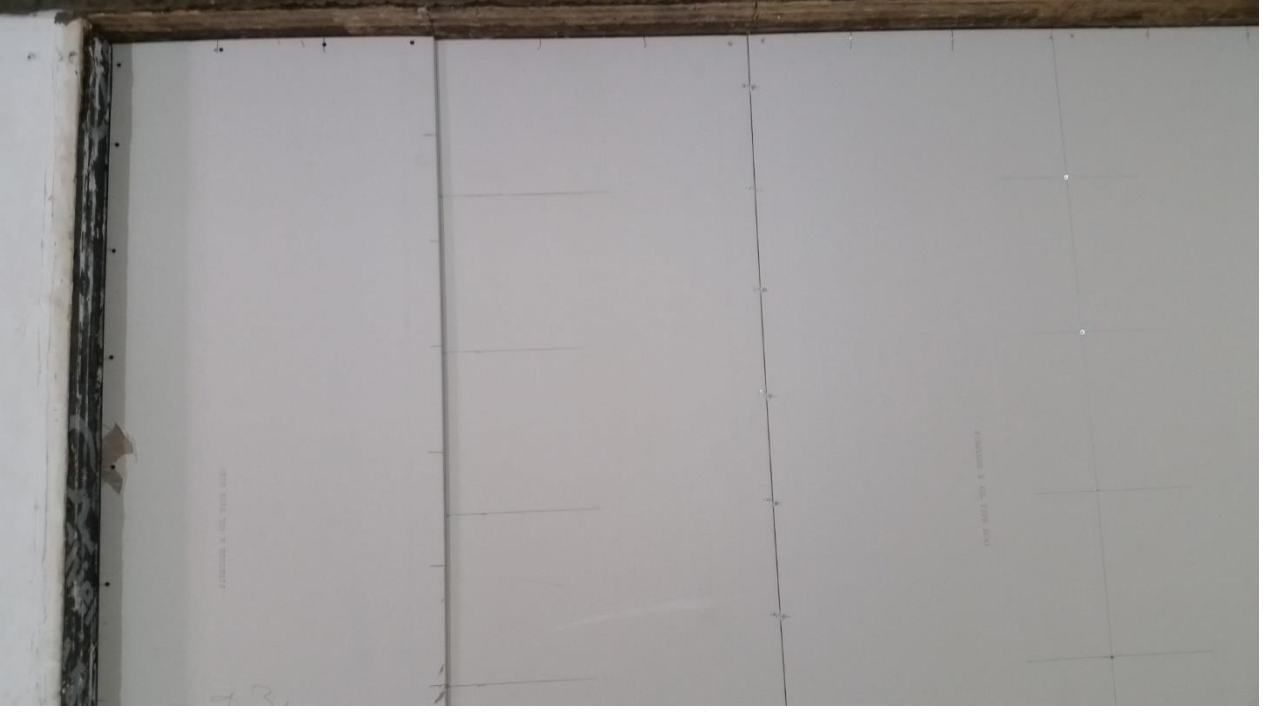
Figure 4 – Gypsum board layer partially installed over existing gypsum board layer