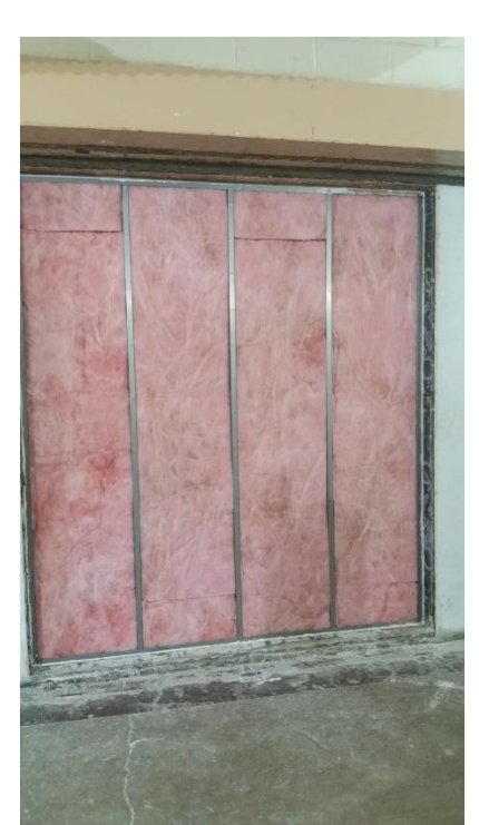
Figure 3 – Stud cavity insulation installed